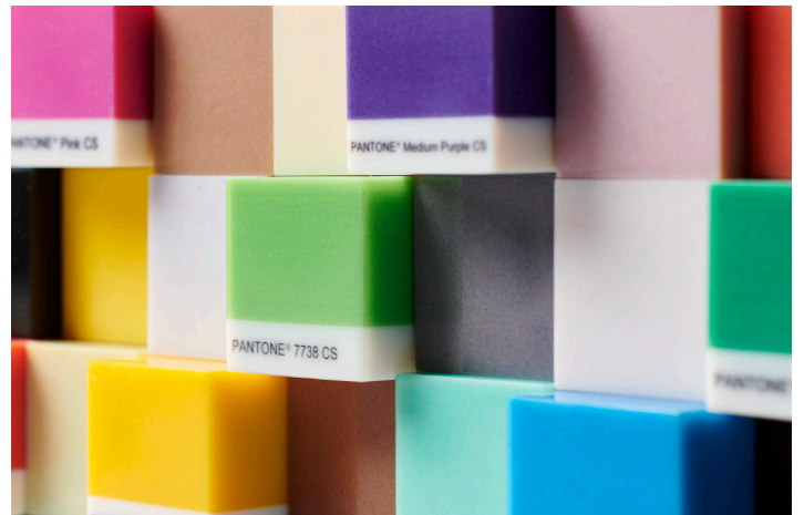
Pantone color blocks